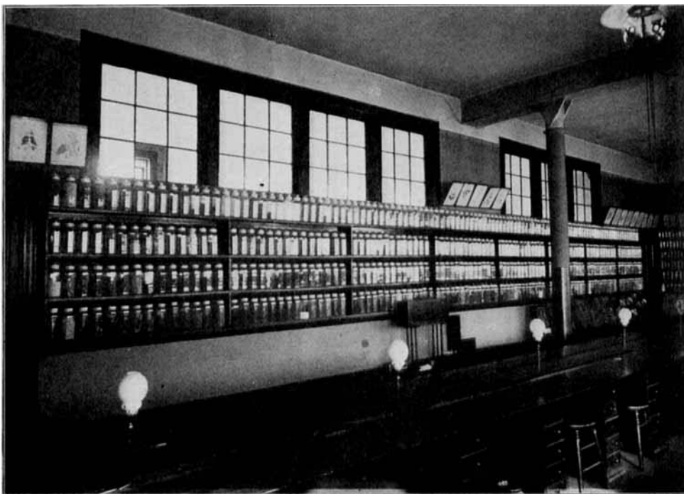
Collection of Official Drugs, University of Illinois, School of Pharmacy.

by any courtesy be named a museum: one hundred dollars a year for ten years judiciously expended by a capable, earnest curator would provide a fine nucleus for a good museum. A museum when once established largely grows without any serious expenditure of time or money. Little gifts each of relatively small value to the donor are being constantly received. Specimens of drugs often rare and therefore valuable in the museum are received from time to time for purposes of identification. The residue of samples obtained for inspection from the custom's service may be added to the museum. Samples of fine chemicals and galenicals prepared in the class room find their place in the museum. Col-