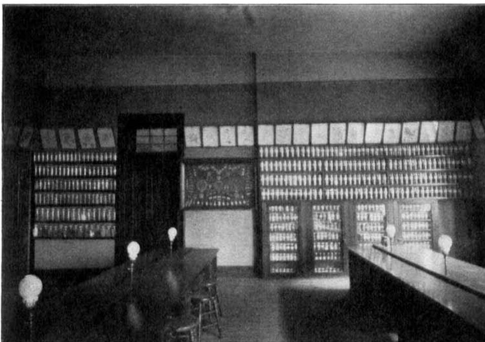
Collection of Rare, Foreign and Powdered Drugs, University of Illinois, School of Pharmacy.

teachers should be provided first, well-equipped laboratories next, a modern pharmaceutical library third, and the museum fourth. Second, the value of the museum to the college is very great. No student should be expected to learn the physical characteristics of a drug, chemical or medicine without having the opportunity of seeing, tasting and smelling the article. No teacher should attempt to present the description of any article of pharmacognosy without being fully familiar with its commercial appearance. The museum is the place to learn the appearance of a drug in a way that it will be remembered. For research work in pharmacognosy the value of the museum is unquestioned. To the average